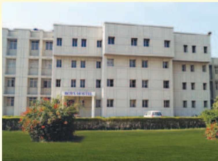
RAM-EESH BOYS HOSTEL

Hostel facility is available both for boys and girls. The rooms are spacious, airy and well furnished. Excellent hygienic conditions are ensured through regular maintenance and cleanliness. Students have enough freedom to live independently but each one of them is required to follow a code of conduct so that all live like a 'joint family' and have a strong 'we' feeling. Full time watch and ward facility has also been provided by wardens residing in the campus to check any untoward incident and provide immediate help. In addition, there is 24 hours security available.