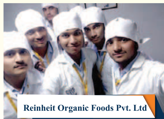
Reinheit Organic Foods Pvt. Ltd