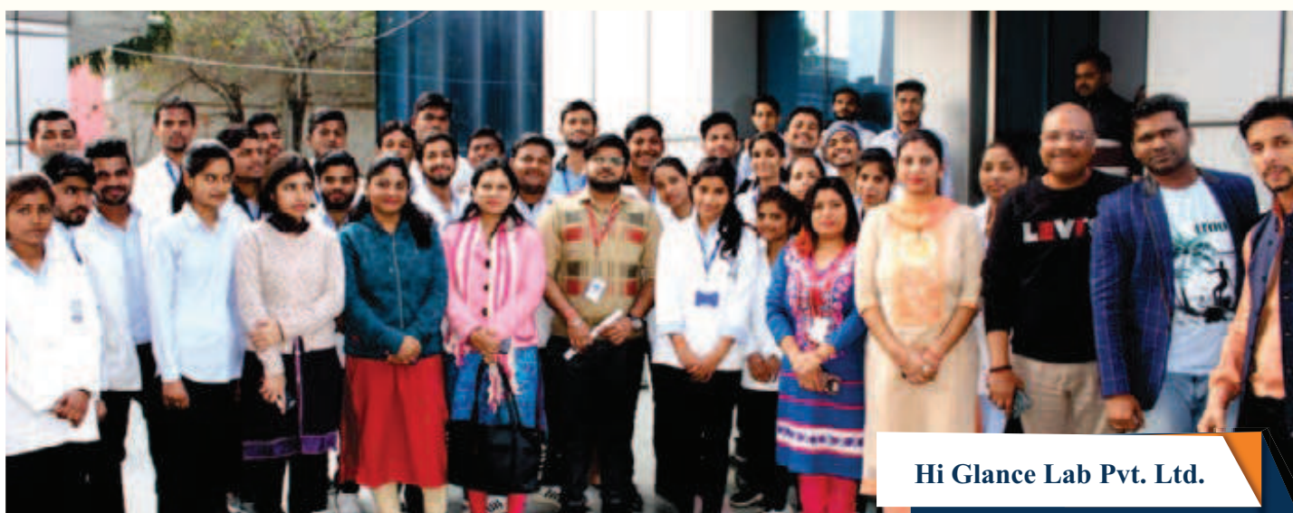
Hi Glance Lab Pvt. Ltd.