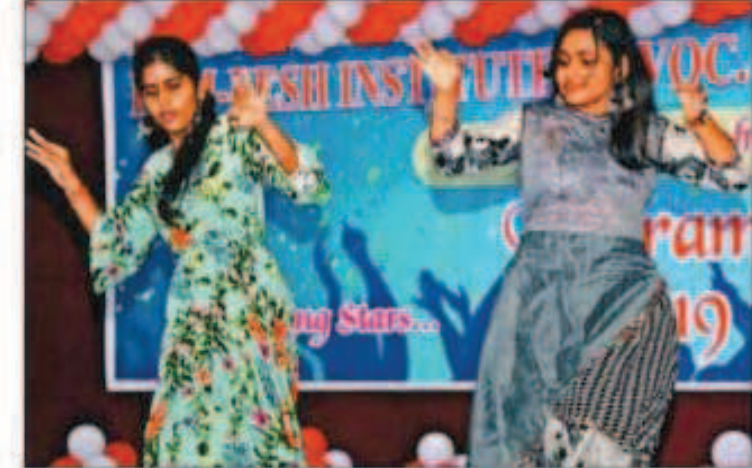
रामईश में कार्यक्रम में प्रस्तुति देती छात्राएं।