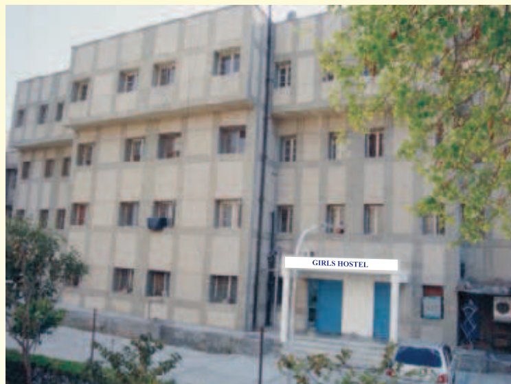
RAM-EESH GIRLS HOSTEL