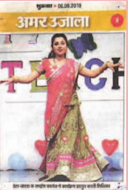
ग्रेटर नोएडा के रामईश संस्थान में कार्यक्रम प्रस्तुत करती विद्वान