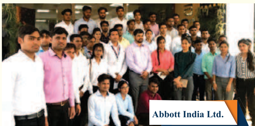
Abbott India Ltd.