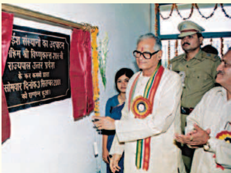
Inauguration of Ram-Eesh Group of Institutions by His Excellency Late Shri Vishnukant Shastri, Former Governor of U.P.

At Ram-Eesh, it has also become a continuous endeavor of all the Institutes to create socially aware and socially responsible individuals by inculcating the values of righteousness, integrity, service and truth.